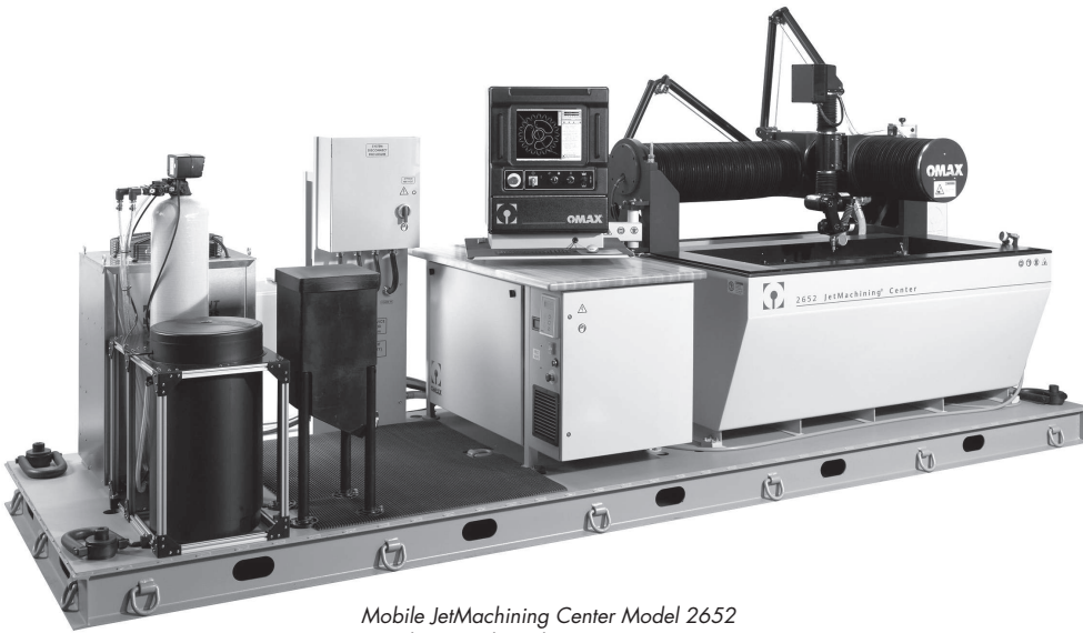
Mobile JetMachining Center Model 2652 shown with a Tilt-A-Jet® accessory